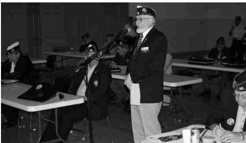
Speaking to the Sixteenth District assembly from the back of the room prior to its close, Commander